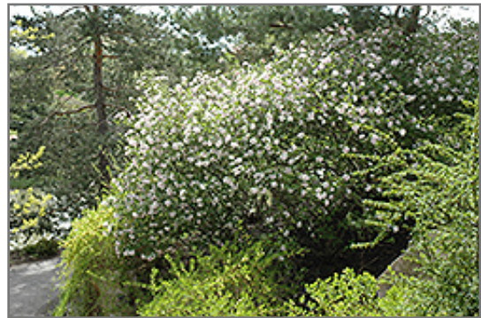
Judd's Viburnum in bloom