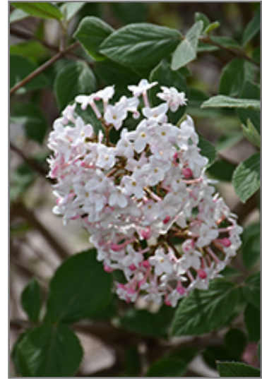
Judd's Viburnum flowers

This is a relatively low maintenance shrub, and should only be pruned after flowering to avoid removing any of the current season's flowers. It is a good choice for attracting birds to your yard, but is not particularly attractive to deer who tend to leave it alone in favor of tastier treats. It has no significant negative characteristics.