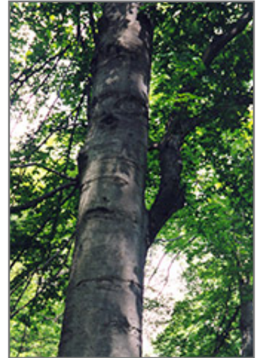
American Beech bark

This tree should only be grown in full sunlight. It requires an evenly moist well-drained soil for optimal growth, but will die in standing water. It is not particular as to soil pH, but grows best in rich soils. It is quite intolerant of urban pollution, therefore inner city or urban streetside plantings are best avoided, and will benefit from being planted in a relatively sheltered location. This species is native to parts of North America.