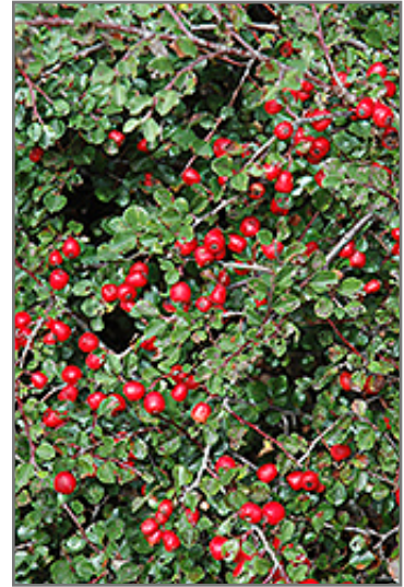
Cranberry Cotoneaster fruit