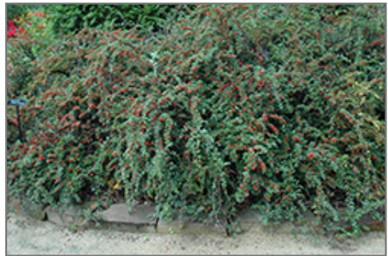
Cranberry Cotoneaster