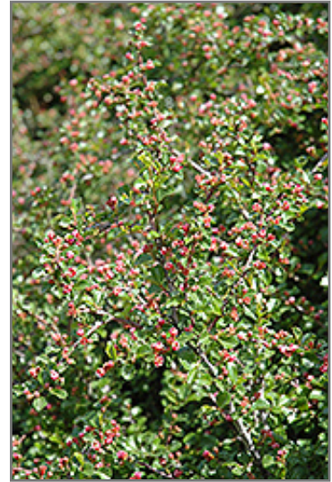
Cranberry Cotoneaster flowers

This shrub does best in full sun to partial shade. It is very adaptable to both dry and moist growing conditions, but will not tolerate any standing water. It is not particular as to soil type or pH, and is able to handle environmental salt. It is highly tolerant of urban pollution and will even thrive in inner city environments. This species is not originally from North America.